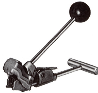
OUTIL P1 - HD P1 - HD TOOL N° 50. P1 - HD